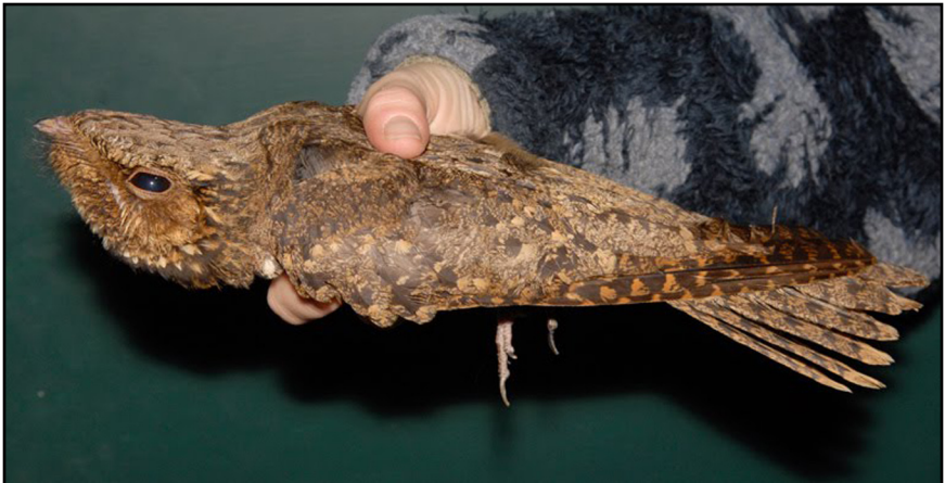
This Chuck-will's-widow on 16 May 2010 was the second record for Whitefish Point and the Upper Peninsula, and the first ever banded in the state.

Red-bellied Woodpecker (3,8,26) Reported in the UP from Alger, Delta and Keweenaw.