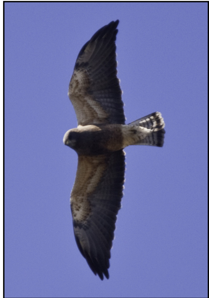
Six Swainson's Hawks recorded by the Keweenaw Raptor Survey this spring was a very good total for the state of Michigan, and included this individual on 1 May 2010.

Swainson's Hawk (3,0,0) 1 on 27 Apr, 1 on 29 Apr, 2 on 1 May, 1 on 2 May and 1 on 18 May at the Keweenaw Raptor Survey; 1 on 1 May at Marquette (SHa); 1 on 2 May, 1 on 17 May and 1 on 29 May at WPBO.