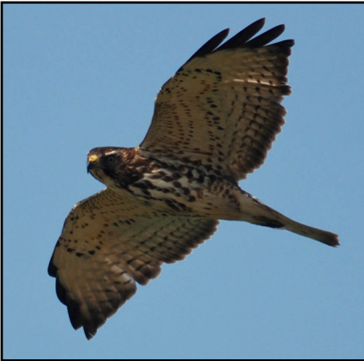
The Keweenaw Raptor Survey provided the state's highest count of Broad-winged Hawks during spring 2010, including many at eye level like the adult and immature photographed here. Both photos on 15 May 2010 by Skye Haas.

Broad-winged Hawk (9,6,14) FRD – 9 Apr in Midland (RD), 2 on 15 Apr in Marquette (SHa) were early locally. 1721 during the season with a peak of 606 on 30 Apr at Port Crescent SP, Huron (ME); 4693 during the season with a peak of 988 on 1 May at the Keweenaw Raptor Survey and 2582 during the season with a peak of 1200 on 1 May at WPBO. Large migratory