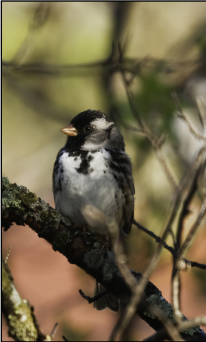
This Harris's Sparrow, in fine alternate plumage, was at Copper Harbor on 1 May 2010.

Harris's Sparrow (1,0,2) a molting bird present 7–21 Apr in Van Buren (MWy); 1 on 1 May at Copper Harbor, Keweenaw (MHe); 1 on 2 May at SNWR (JDS).