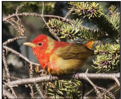
Two Summer Tanagers reached the Upper Peninsula in spring 2010, including this first-year male at Iron River, Iron Co. on 8 May 2010. Photo by Beth Rogers.

Lincoln's Sparrow (8,5,6) FRD – 1 on 9 Apr at Willow MP, Wayne (WP) was very early, the next reports were on 30 Apr in Bay and Macomb . HRT – 13 on 15 May at Metro Beach MP, Macomb (AC). Last migrant in the SLP on 22 May in Berrien (JW).